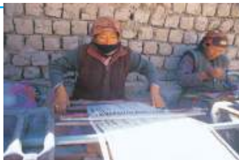
Woman weaving a pashmina shawl

Buddhism reached Tibet via Ladakh. Ladakh is also called Little Tibet. Islam was introduced in this region more than four hundred years ago and there is a significant Muslim population here. Ladakh has a very rich oral tradition of songs and poems. Local versions of the Tibetan national epic the Kesar Saga are performed and sung by both Muslims and Buddhists.