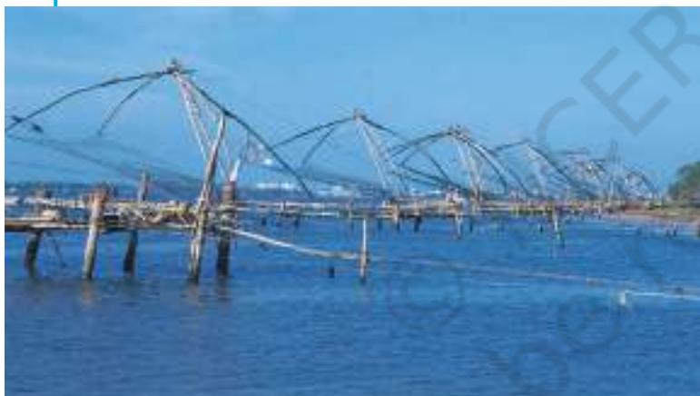
Chinese Fishing Nets

Even the utensil used for frying is called the cheenachatti, and it is believed that the word cheen could have come from China. The fertile land and climate are suited to growing rice and a majority of people here eat rice, fish and vegetables.