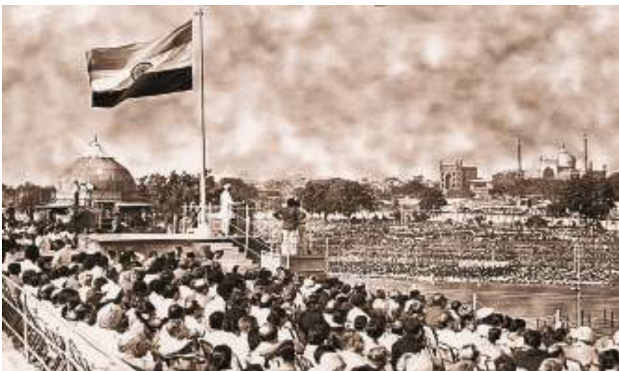
Pt. Nehru delivering an Independence Day speech

Songs and symbols that emerged during the freedom struggle serve as a constant reminder of our country's rich tradition of respect for diversity. Do you know the story of the Indian flag? It was used as a symbol of protest against the British by people everywhere.