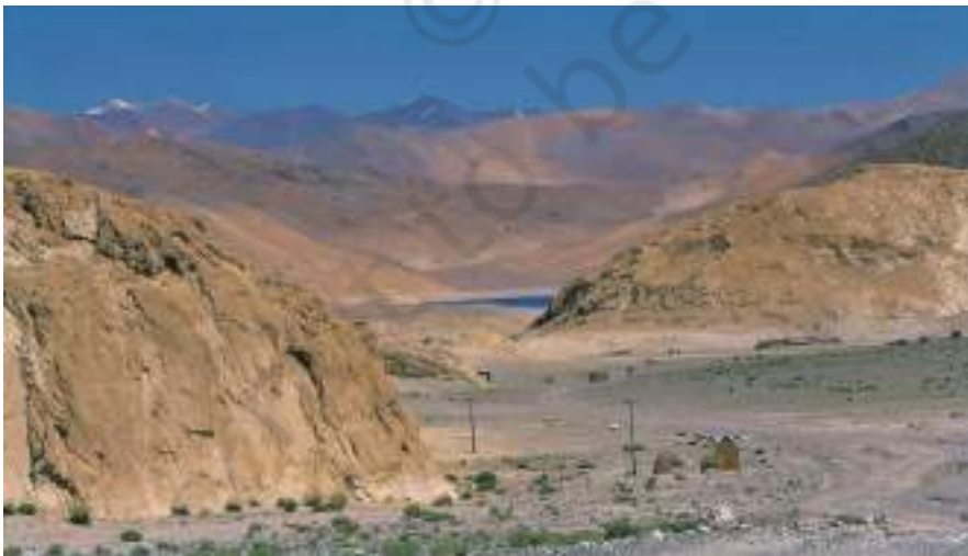
The dry barren landscape of the mountainous desert of Ladakh.

Ladakh is a desert in the mountains in the east of Jammu and Kashmir. Very little agriculture is possible here since this region does not receive any rain and is covered in snow for a large part of the year. There are very few trees that can grow in the region. For drinking water, people depend on the melting snow during the summer months.