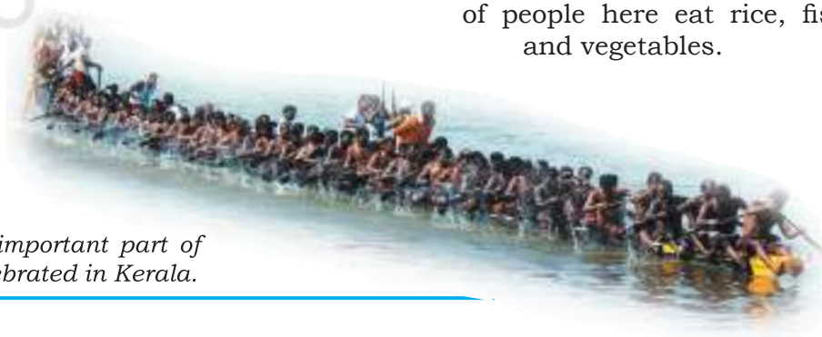
The boat race is an important part of the Onam festival celebrated in Kerala.

an attractive place for traders. Jewish and Arab traders were the first to come here. The Apostle of Christ, St. Thomas is believed to have come here nearly